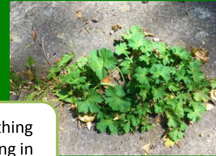
Something Growing in the Cracks