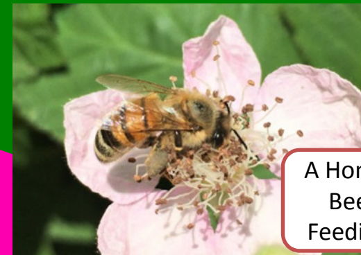
A Honey Bee Feeding