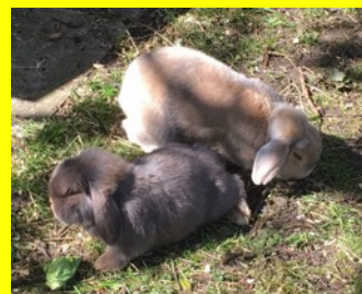
Whizzy and Speedy